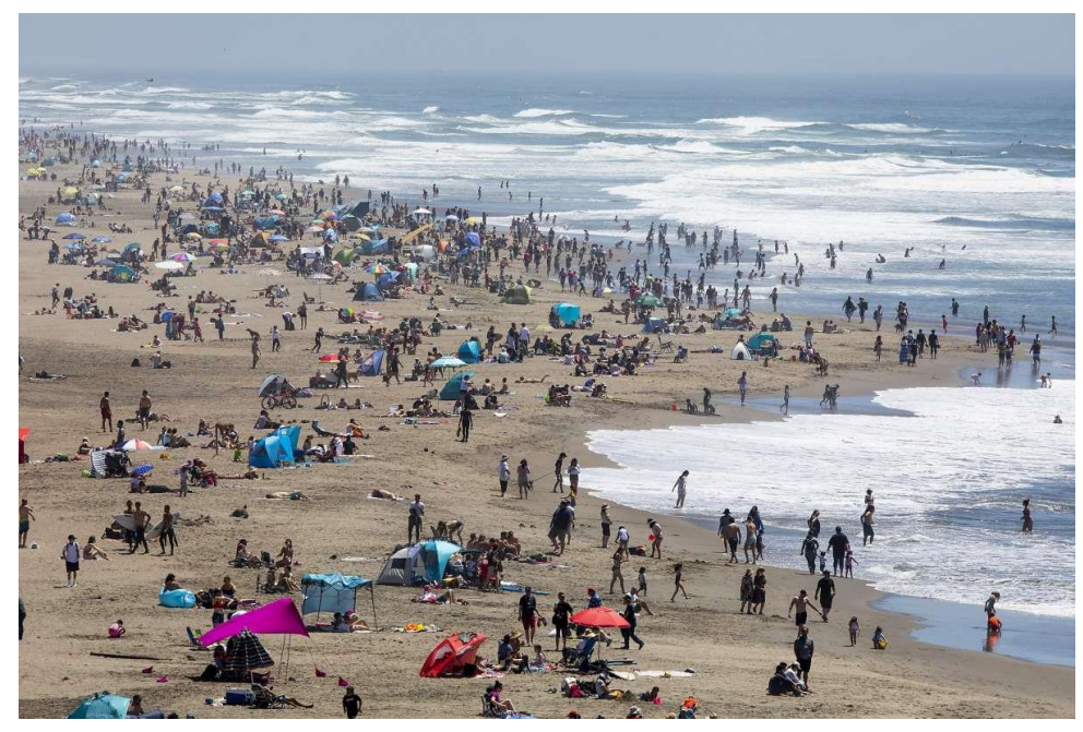
People seek relief from extreme heat at Ocean Beach

Influencing the wildfires and air quality events over the summer in 2020, was a period of record setting extreme heat in late August and early September that impacted the Bay Area broadly and led to San Francisco seeing 100°F temperatures for the first time since 2017.<sup>13</sup> On Sunday September 6<sup>th</sup> 2020, over 10 Bay Area cities set new records for extreme temperatures. This period of extreme heat not only presented a direct hazard to public health, but also contributed to the wildfire conditions.<sup>14</sup> The extreme heat events also put strain on the electrical grid, leading to rolling black outs across the state as the grid operator and PG&E tried to manage the increased demand on the system as well as the decreased resiliency of the grid from the high temperatures.<sup>15</sup> The Department of Public Health is currently analyzing the data to determine the impacts on public health and hospitalization rates from this event.