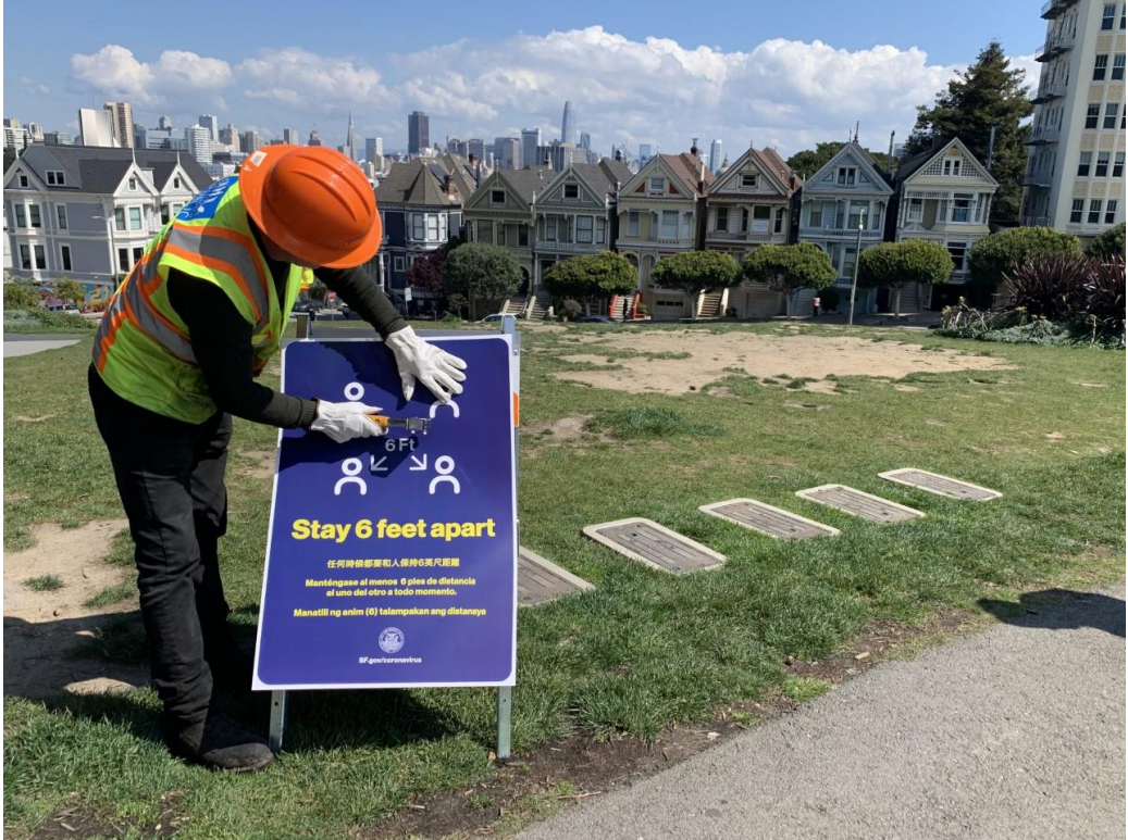
A sign reminds park users of social distancing to mitigate the spread of COVID-19

According to an analysis by the Postal Service, the number of households entering San Francisco stayed relatively constant between 2019 to 2020 but there were significant increases in out-migration. This led to a net-outward flow from the city of 53, 251 households leaving the city, a change of 207.4%.<sup>8</sup> The data points to people moving relatively close, to other Bay Area counties such as Alameda, San Mateo, or Marin and other locations within the state as well.