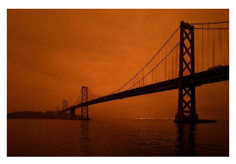
Orange skies on Sep 9, 2020 due to wildfires smoke.

It is still too early to quantify the impacts from this event, but it forced many to shelter-in-place even further and cut off access to the outdoors which had been an important outlet for many people during the pandemic. September 9<sup>th</sup> was particularly memorable, as the area was blanketed in an orange haze due to the dynamics between smoke layers persisting at multiple altitudes from multiple wildfire sources (Northern California as well as the Pacific Northwest), being filtered through the marine fog layer.<sup>12</sup>