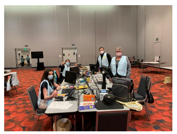
Disaster Service Workers at the COVID Command Center at Moscone Center South

The City and County of San Francisco established the COVID Command Center at Moscone Center South on March 16<sup>th</sup>, 2020 to serve as the centralized location to coordinate the cities response. At the height of the response, this location had over 400 city employees working diligently, and safely to coordinate the numerous aspects of the response efforts. In this role, the center handles a wide range of tasks while interfacing with numerous community partners supporting the response. For a comprehensive list of response activities being pursued by the city, see <u>Appendix F</u> of the Economic Task Force Report.