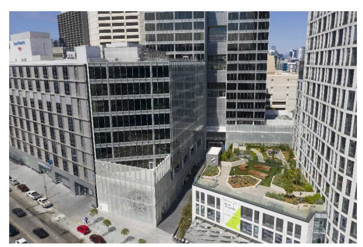
49 South Van Ness which includes new Permit Center

The City opened a new office building at 49 South Van Ness, which features a 39,000 square foot One-Stop Permitting Center and consolidates operations for the Departments of Building Inspection, Public Works, Planning, Public Health, and other departments, which will help to physically streamline the permitting process and enhance regulatory enforcement.