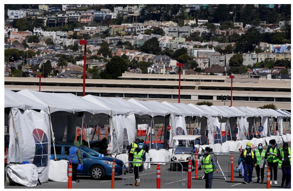
Mass vaccination site at San Francisco City College

<u>Preparedness.</u> At the time of writing in June 2021, 77% of San Francisco adults 16 and over have received at least one vaccine dose.